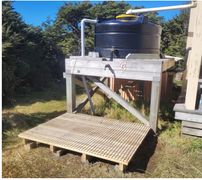
Parks Peak hut: New water tank deck