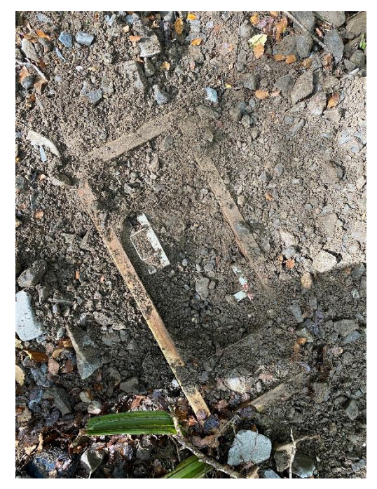
Figure 1 - Whats left of a trap