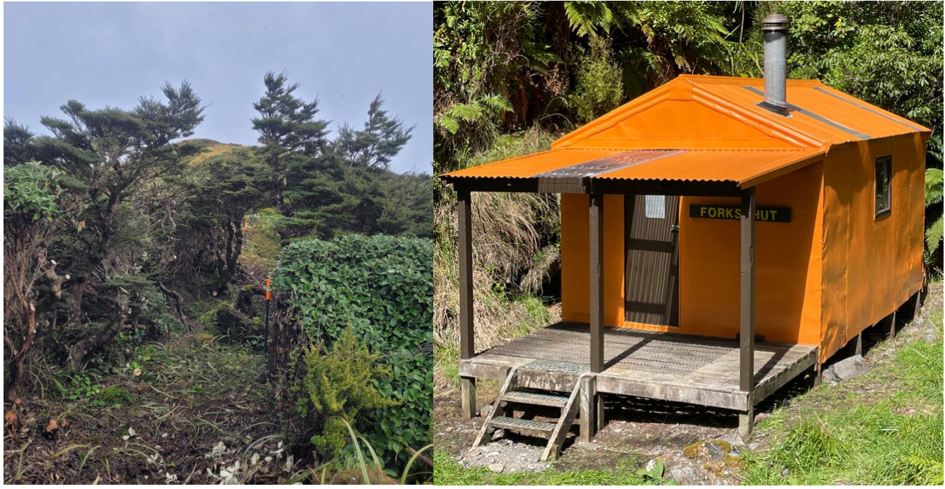
Armstrong Saddle – rerouted away from slip Forks hut: Painted and general maint. By NZDA Man.